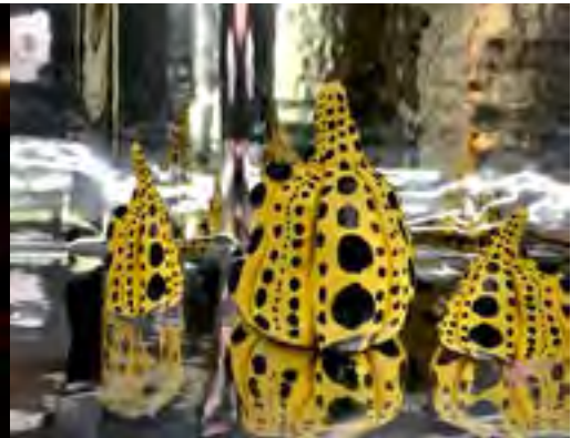
Kusama Yayoi - Infinity Pumpkin Room