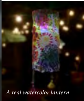
A real watercolor lantern